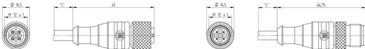
Face View M12 Male