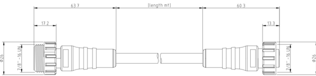
MALE FACE VIEW