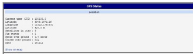
Figure 1: GPS Status – Location

There is a clickable item called Show on map at the bottom part of the window that displays an exact location of the Hirschmann router on the map server of Google company (Google Maps) in a new tab.