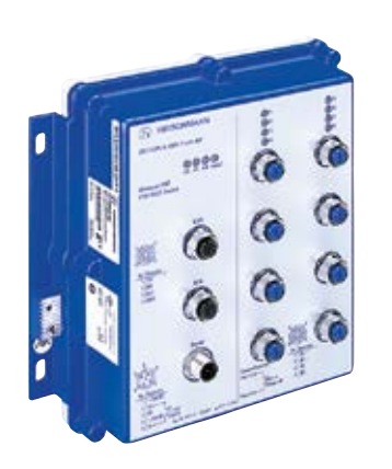
Hirschmann™ OCTOPUS Train-BP managed IP67 switch guarantees high-availability data communication in trains