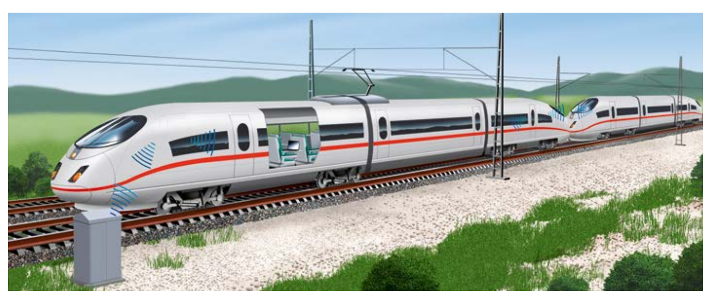
The new BE43802 is a key component in the total Belden Cat 7 Railway solution

The cable's highly stranded conductor offers increased flex life and the unique cable design supporting improved operational efficiency whilst assuring passenger safety and comfort.